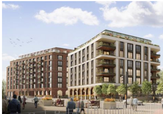
Plans to replace the Debenhams have been drawn up by Squire & Partners

The consulting team behind the plans included Arcadis as project manager, DP9 as planning consultant, Robert Bird Group as structural and civil engineers, Cast as cost consultants and Sweco as service engineers and sustainability consultants.