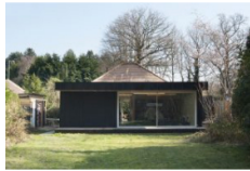
Rashid Ali Architects one year on from 2021 AJ Small Projects win