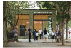
Case study: National Youth Theatre by DSDHA