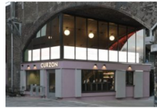
Case study: Curzon Camden Cinema by Takero Shimazaki Architects