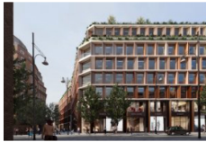
AHMM makes £500,000 loss as income plummets