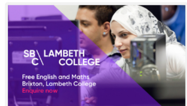
Improve your English and Maths skills for FREE at Lambeth College