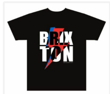
Brixton Bowie T-Shirt