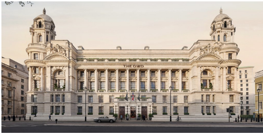
The OWO Raffles London

by Lauren Jade Hill | 12 Apr 2022 | Hotel Projects, Projects