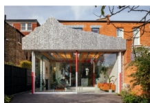
CAN completes PoMo-style house based on Disneyland