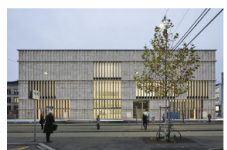
Chipperfield completes £175m extension to Kunsthau Zurich