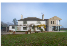
Ansham Associates completes clapboard extension to Kent