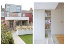
Novak Hiles reworks house with sculptural chamfered extension