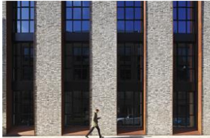
Alexandra Palace, north London