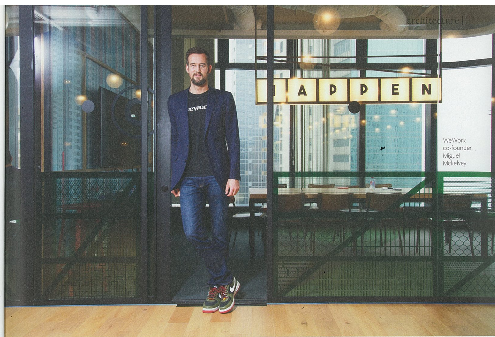
WeWork co-founder Miguel Mckelvey

To find more international co-working spaces log onto enkimagazine.com