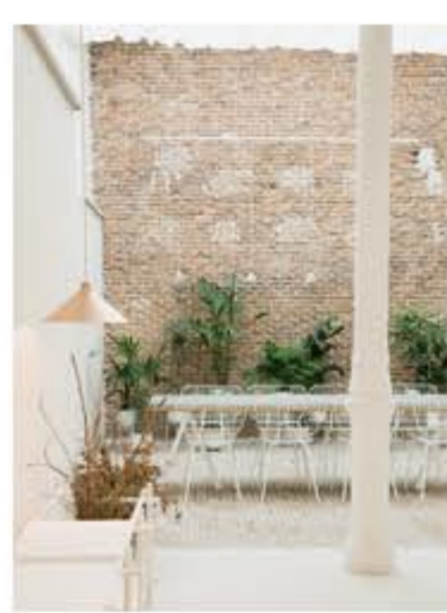
A STUDY with harmony