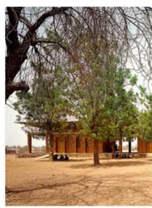
The man from the SOUTH