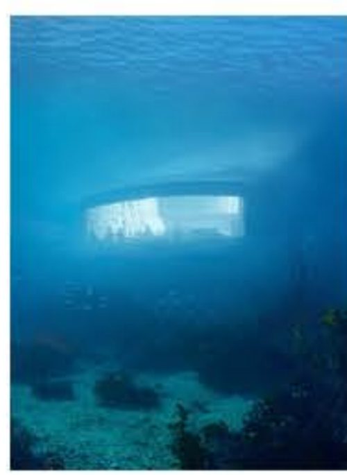
This will be the first SUBMARINE restaurant in Europe