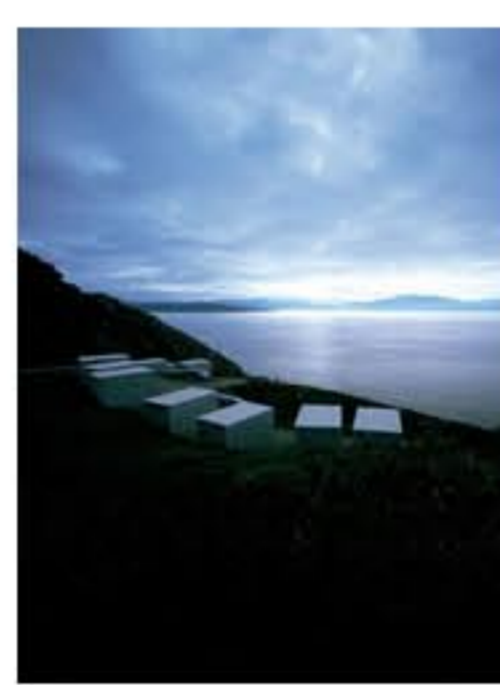
I want to DIE here