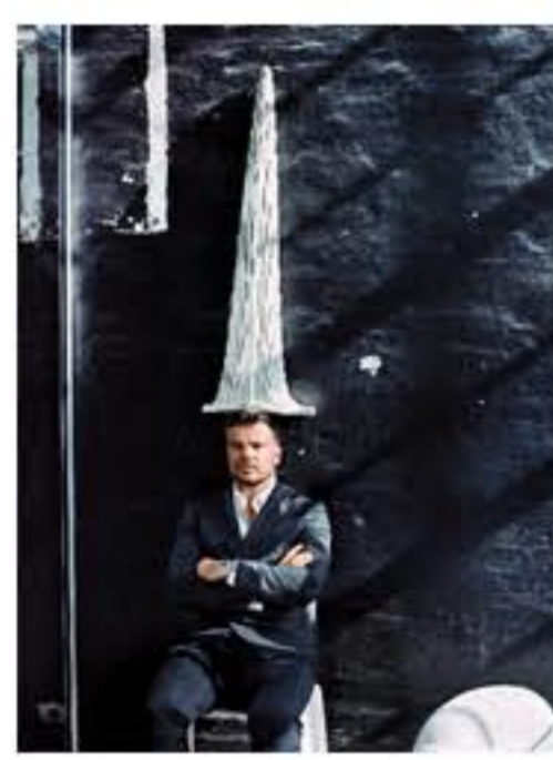
This architect is going to change NEW YORK