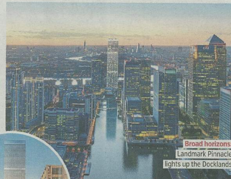
Broad horizons: Landmark Pinnacle lights up the Docklands

Further west, White City Living is developer St James' 10-acre, multi-building scheme of 1,477 new