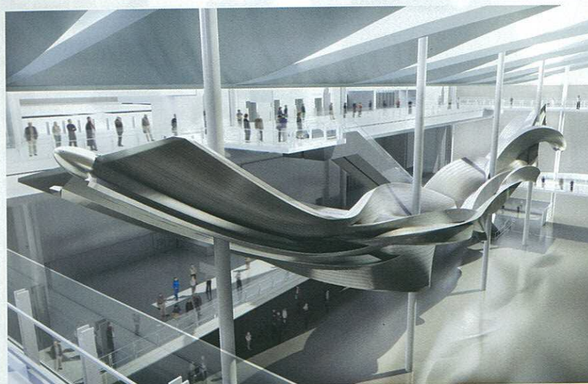
Top: 'A Room for London' designed by David Kohn Architects in collaboration with artist Fiona Banner for Living Architecture, Artangel and Southbank.

The following montage from the presentations shows a series of live projects with 'arty-ecture' as part of their DNA. ■■