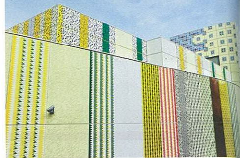
Above: Jacqueline Poncelet, 'Wrapper'. Vitreous enamel. Edgware Road (Circle line) Underground station, London. Commissioned and produced by Art on the Underground, 2012.