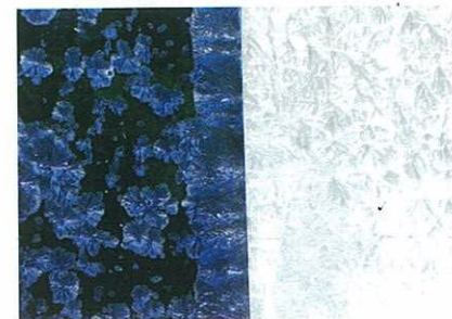
Bottom: 'Out of the Strong' by Ian McChesney in Derwent London's Angel Building atrium, designed by AHMM.