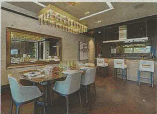
Dine in: Kitchens all have Miele integrated appliances

Call 020 8877 8920 now to claim 10% off orders placed by end of November (Quote AYRMT). Or visit Ayrton showroom at 406 Merton Road, London SW18 5AD