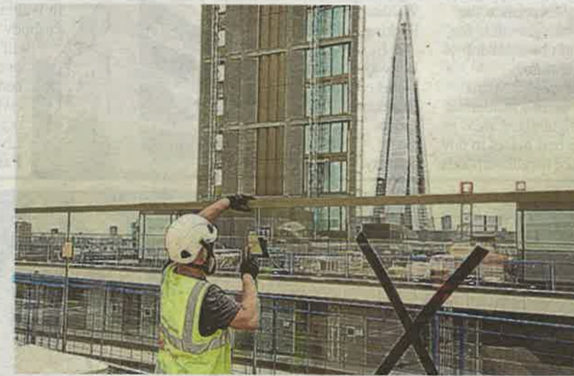
Towering high: Some of the apartments will offer unrivalled views of Tower Bridge, such as the triplex penthouse in The Tower, which has a glass-walled roof terrace (above), while others will look out over The Shard (left)

views of the Bridge and the Tower, or of the London Assembly and The Shard, depending which way you look.