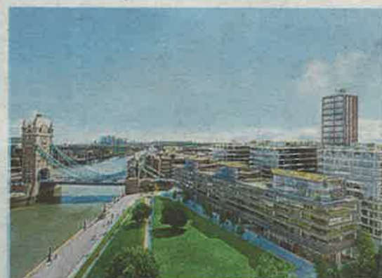
Riverside living: The development has a stunning outlook