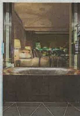
Luxurious: A master suite