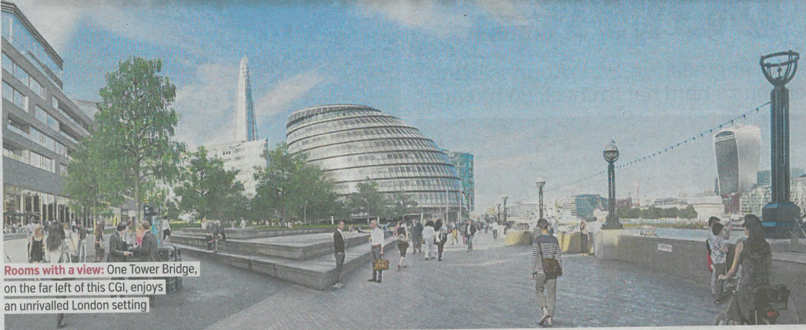
Rooms with a view: One Tower Bridge, on the far left of this CGI, enjoys an unrivalled London setting

Predominantly known for its theatres and art galleries, now a range of new residential developments are popping up in this buzzing riverside district