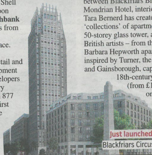
Just launched: Blackfriars Circus

Just behind the Southbank, Barratt London has just launched Blackfriars Circus (one-beds from £490,000, barratlondon.com ), a collection of 336 new homes, shops, cafes and offices within walking distance of the Tate Modern, the Old Vic and the Southwark Playhouse.