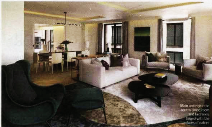
Main and right: the neutral living room and bedroom, tinged with the colours of nature.

50 St Edmund's Terrace is a rare collection of new homes being built in Primrose Hill, overlooking Regent's Park. Moments away from the Jubilee Line at St John's Wood and the Northern Line at Chalk Farm, it's also the first time the interiors team at Squire and Partners have worked with the architectural team from the very beginning of a project to plan out the