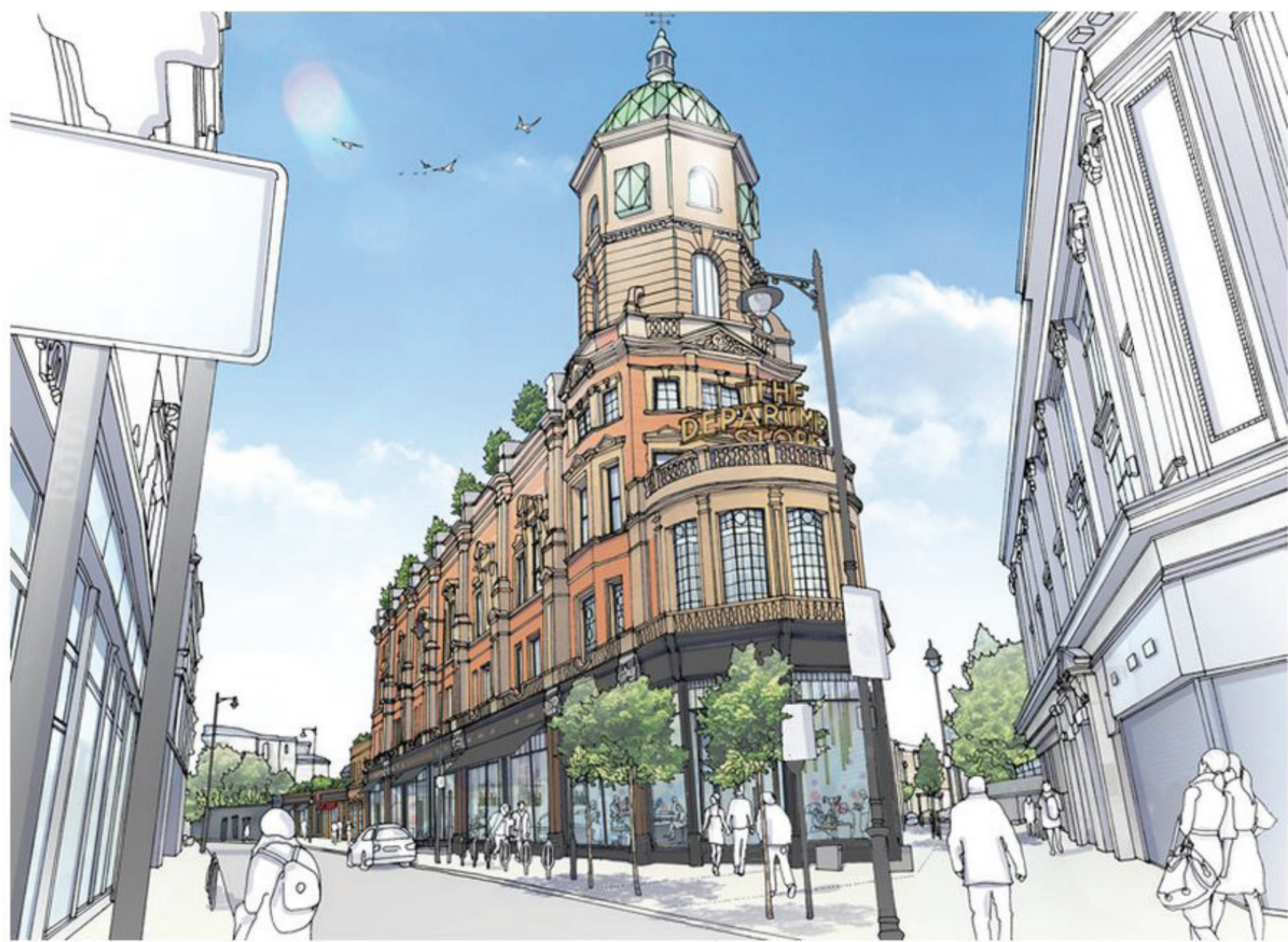
An illustration of the refurbished buildings on Ferndale Road