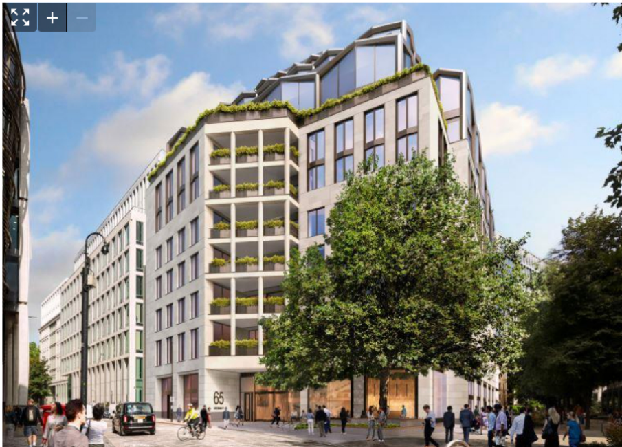
Outdoor workspace will be added to every floor of the refurbished building

Square Mile planners describe plans as 'exemplary retrofit scheme'