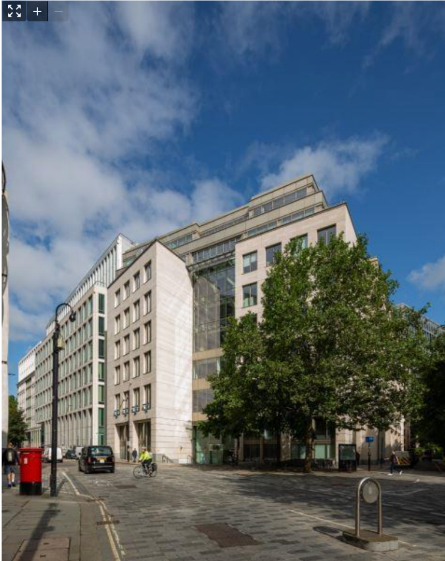
The existing building will be 24 years old by the time the final tenant moves out in summer 2025

In a design and access statement put together by Squire & Partners for client JP Morgan Asset Management the current building is described as "poorly configured in places and overall looks dated".